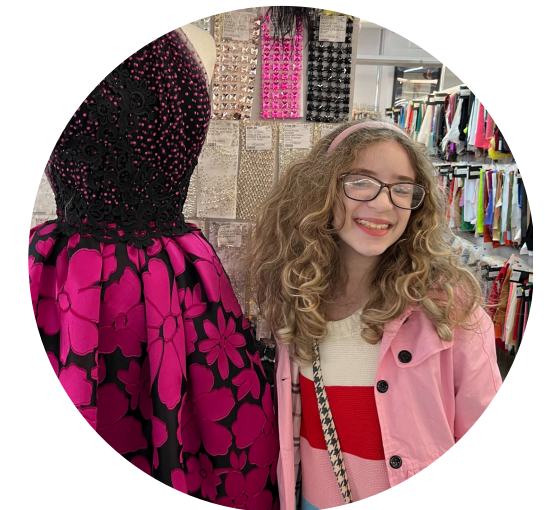
River, Age 14

Dreamed to go on a Royal Caribbean Cruise